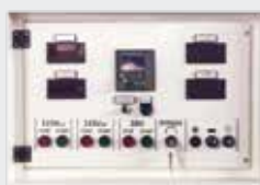
Pictures may not show the actual product due to presence or absence of items